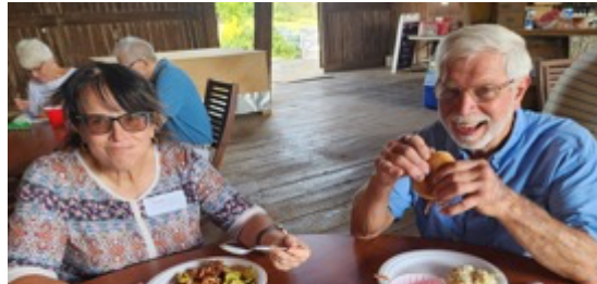
Terry & Clyde House